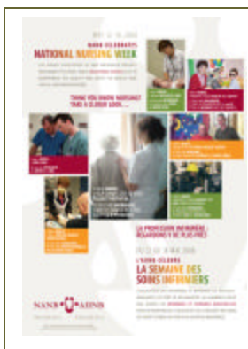
NANB's 2008 Nurses Week Poster

Congratulations to the winners and thank you to all members who contributed to this successful initiative.