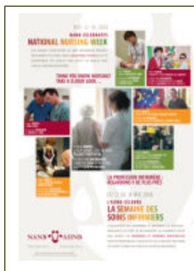
NANB's 2008 Nurses Week Poster

Congratulations to the winners and thank you to all members who contributed to this successful initiative.